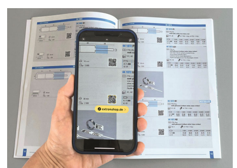
Fig.1: New in the eXtra4 catalogue: via QR code directly to the item with up-to-date prices in the webshop