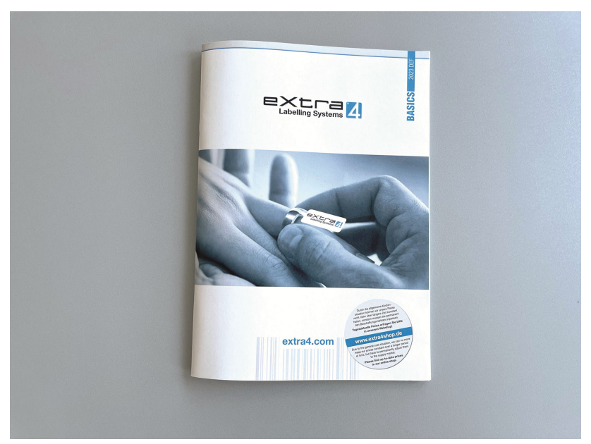
Fig.2: Cover from the eXtra4 Labelling Systems stock catalogue, updated for the 2023 autumn trade fair season